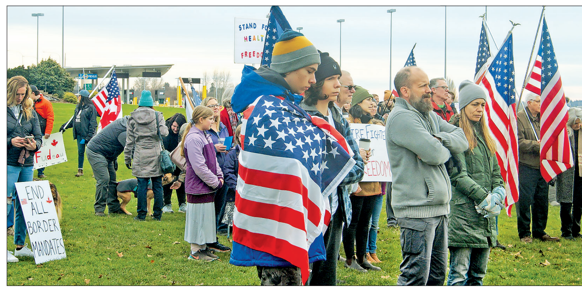
▲ People in support of the "Freedom Convoy" to Ottawa gathered at Peace Arch State Park on January 29 to protest vaccine mandates for truck drivers.