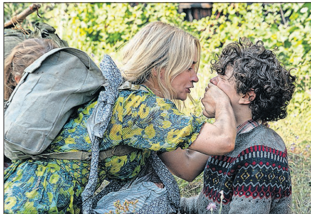
Emily Blunt, left, and Noah Jupe star in "A Quiet Place Part II."

The particulars are a bit more complicated, and we see now how this new world order came to be: a race of alien beings who really don't like noise came crashing to the Earth during an otherwise normal afternoon in an idyllic Connecticut town. Writer-director John Krasinski, back on board after the monster success of the first film, shows the beginnings of the story, pushes things