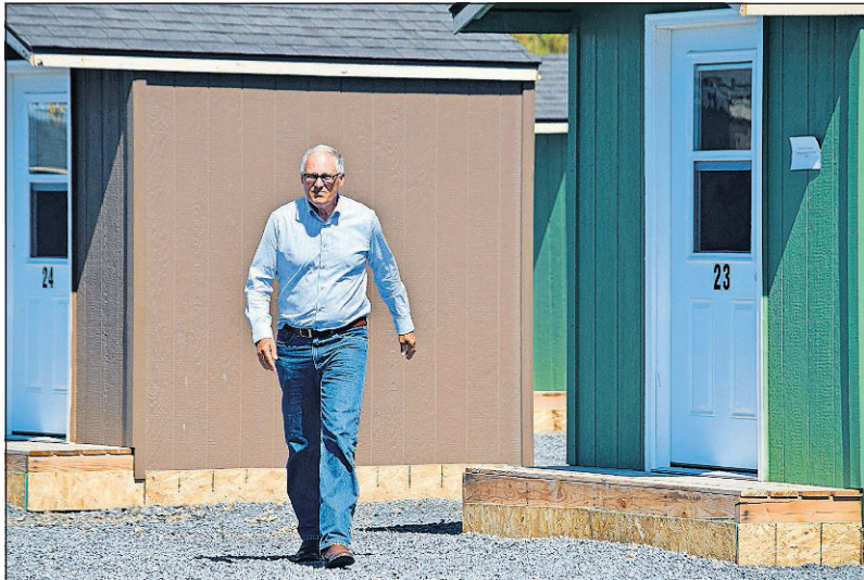
Gov. Jay Inslee walks among the cabins of the Moses Lake Sleep Center during his tour on Thursday.