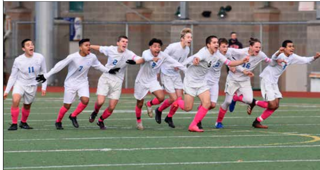
OHS Soccer team celebrates their win against Providence Classical Christian