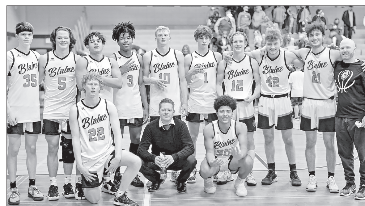
▲ Blaine's boys varsity basketball team will move on to the bi-district playoff this weekend with its 58-37 win over Nooksack Valley.