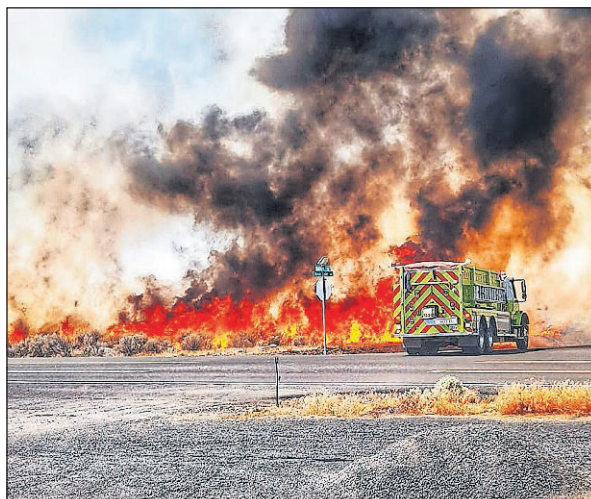
This fire, near Neva Lake Road Northwest off Dodson Road Northwest, burned about 27 acres Sunday.