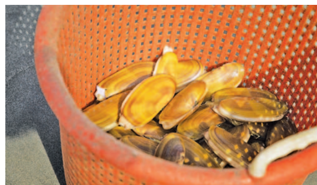
Many commercial clammers use baskets to hold their clams as they dig.