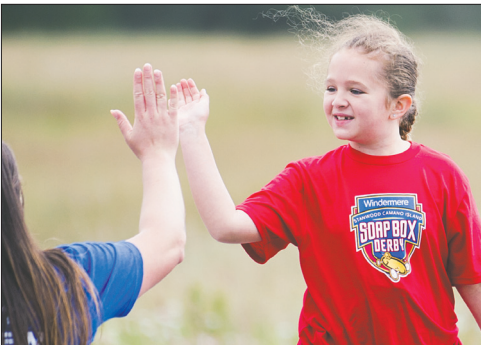
Kids were greeted by a few of the 200 volunteers at the bottom of the track.