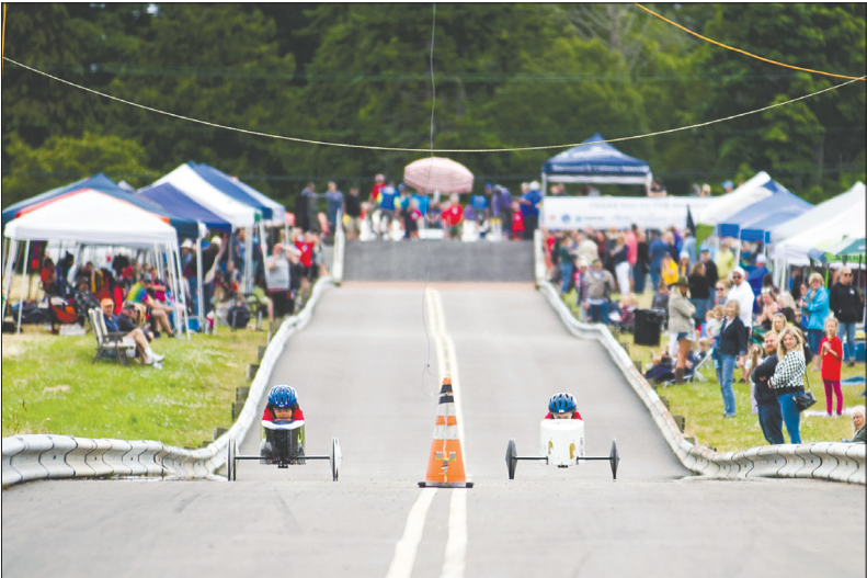
Two drivers cross the finish line and prepare to brake.