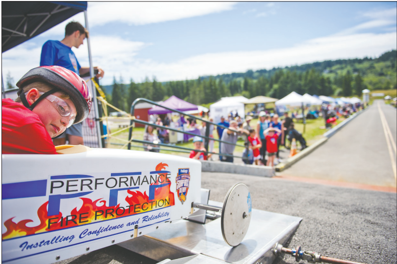
A racer awaits the start at the top of the track.