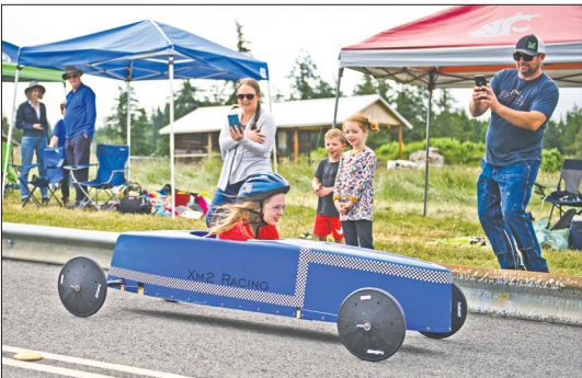
A racer’s hair whips in the wind as spectators cheer and film along the track.

ONLINE: See many more photos from the derby at SCnews.com/gallery