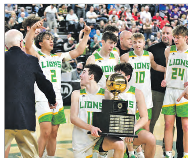
The Lynden boys and both the Lynden Christian boys and girls celebrate their state championship victories following wins on Saturday at the Yakima Valley SunDome.