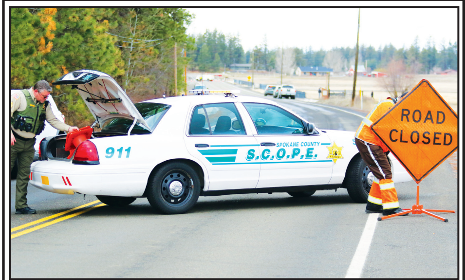
Bob Kirkpatrick photo