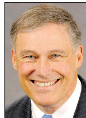
Gov. Jay Inslee