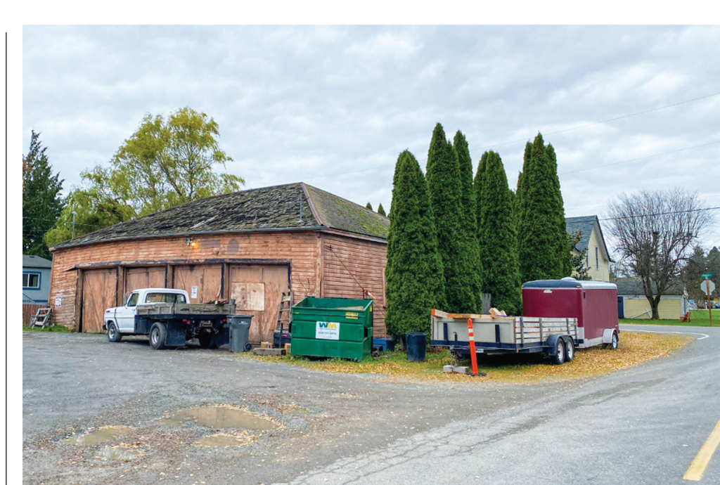
WILL THIS CHANGE BE CONTROVERSIAL? – Kate and Brandon Atkinson have an application in to the Town of La Conner to build a 20-unit apartment building on the corner of Center and Fourth streets. A conditional use permit must be approved for the proposed 14 long term units and six short term dwelling spaces.